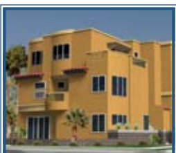
VILLA DE BAYO